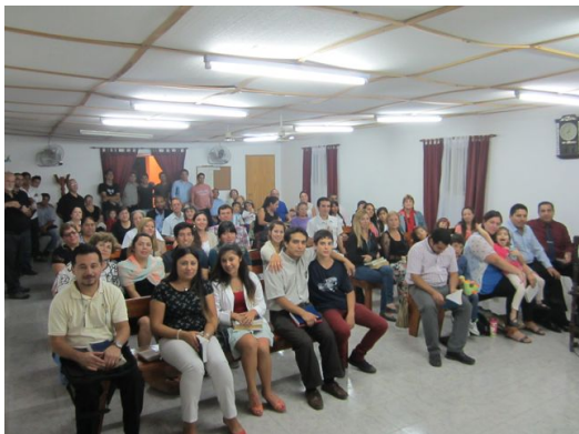
Congregation in Presidente Derqui with visitors

P.O. Box 123 Port Murray, NJ 07865 GardnerHall3@gmail.com www.gardnerhall.com