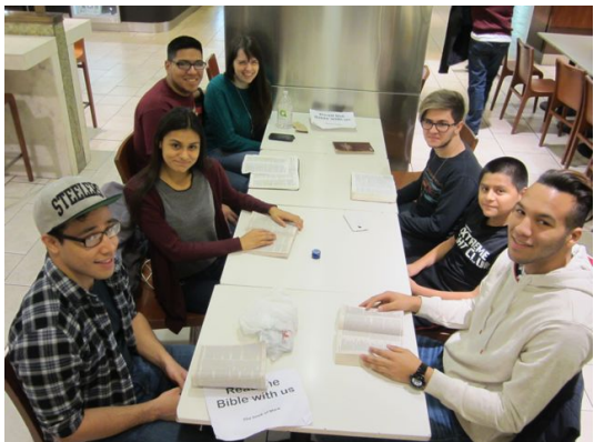
Bible class at Garden State Plaza Mall, Saturdays,

P.O. Box 123 Port Murray, NJ 07865 GardnerHall3@gmail.com www.gardnerhall.com