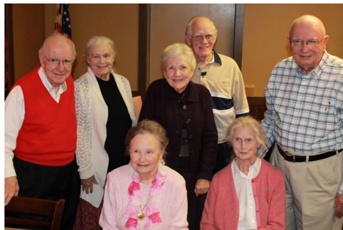
From the Hall family reunion