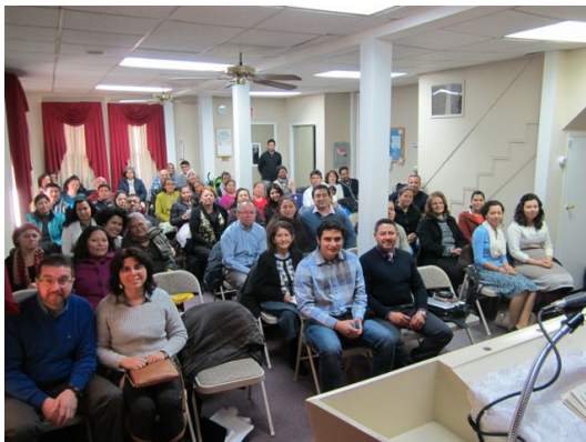
Adults, Hispanic church in Flushing, Queens